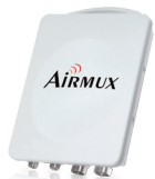
Airmux-Mobility Mobile Wireless Access