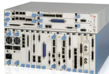
Megaplex-4 Next-Generation Multiservice Networking Node