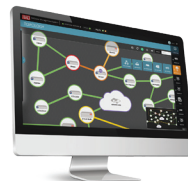
RADview Network Management and Orchestration