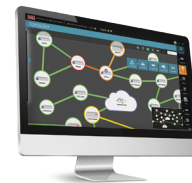
RADview Network Management and Orchestration